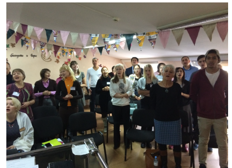
(Conference in St.Petersburg)

Merry Christmas & A Very Happy & Blessed New Year !