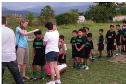
After Soccer Coach filled with Holy Spirit, He invited the CBC Team to minister to his boys