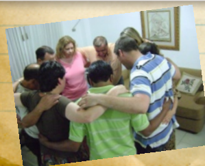
The CBC Atlanta team ministering to a home bible study group in Machala Ecuador.