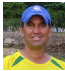
Soccer Coach was baptized in the Holy Spirit