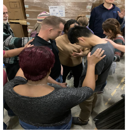
Team praying for those at the Durham Rescue Mission

of attending a Charis Bible College at some point in her life and there we were! Another woman who was wheel chair bound checked into the hotel just to have a warm place to sleep in the midst of the anticipated power outages! But that was not all she needed. She was down and out and felt like God had deserted her. By evening she was walking and praising God!