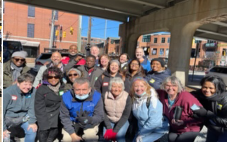
CBC Minneapolis & CBC Ann Arbor Michiaan