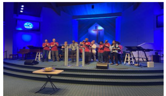
Team Ministering at Bethel Church-Wed. Night

The second team came the third week of February. It was made up of a total of 17 people; 10 from the Minneapolis school and 7 from the school in Ann Arbor Michigan. One of the students was from Wisconsin and drove 6 1/2 hours each way to attend school in Minneapolis two Saturdays a month, while another attending the Ann Arbor school commuted from Ohio twice a month. Not only did they come from different cities and different states but they fit into different age groups, and they came from multicultural and racial backgrounds. One of them was from India, one from Ethiopia, one from Liberia while still another was from Nigeria. The amazing thing about this team was that the students from the respective schools had never physically met each other and although their backgrounds were so diverse, they flowed together as one. Every one of them had the same agenda: To be Jesus to the people they came in contact with. They were a beautiful testimony of the body of Christ working together as one. For as the body is one, and hath many members, and all the members of that one body, being many, are one body: so also is Christ. For by one Spirit are we all baptized into one body. 1 Corinthians 12:12-13