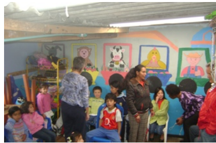
Team ministering in Children's School in Bogota

We are the WOW of God! And God Saw everything that he had made, and behold, it was very good.