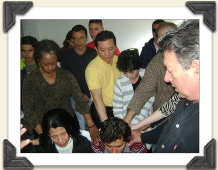
Members of the team pray for members of the Men's Rehab Center. The word brings "Freedom".