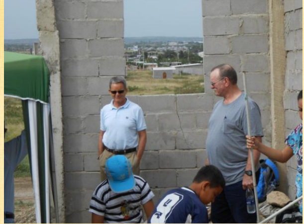
Neighborhood church in Salinas being built.