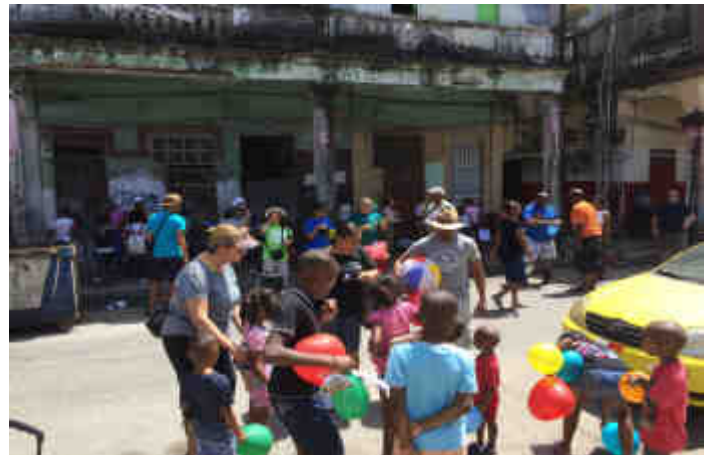
(Team ministering to children in streets of Colon, Panama)

We pray that this story will serve as an encouragement for you to be bold enough to share your own testimony with those people that God brings across your path.