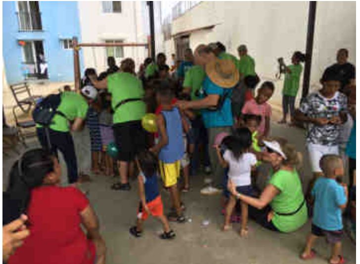
Students praying and ministering to indigenous children and their parents

One of the testimonies that had a profound effect on all of us who heard it, came from a husband and wife who both attend the CBC school in Greenville. After having been married for sixteen years they divorced. Each thought everything was over, but after seven years God restored their marriage. The wife shared how God supernaturally changed both of their hearts toward each other. That was 8 years ago and you could never tell by looking at them now because they appeared to be the perfect couple who has never experienced any problems. It was an incredible story that took all of us by surprise. Who would have guessed? In the audience that night there was a couple who were the ministry leaders in their church. Just that day they had signed divorce papers. After hearing the testimony that night, the very next morning they arranged a meeting with their senior pastor. They told her that they had gone home and torn up the divorce papers and were committed to making their marriage work. They decided not to give up on God or each other. This is what it means in Revelation when it says that they overcame him by the blood of the Lamb, and by the word of their testimony ...".