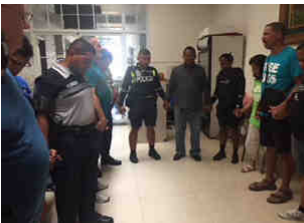
( Team praying for local Police officers )