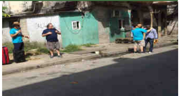
( Team ministering on the street of a local neighborhood)