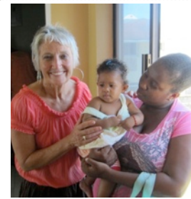
Enjoying beautiful people in Belize