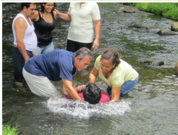
Baptism Service for three teenagers