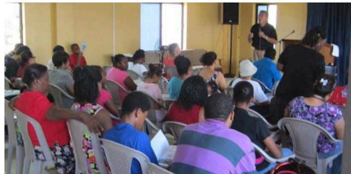
Teaching at CBC in Belize