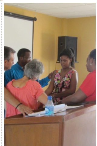
Praying the Prayer of Salvation

I personally believe that there is no greater joy than to be used of the Lord to bring a person the “Good News” of Jesus Christ and to see them receive Him into their lives. It also brings great joy to be used of the Lord to bring “truth” to a believer that sets them free from the lies that Satan has used to keep them in bondage.