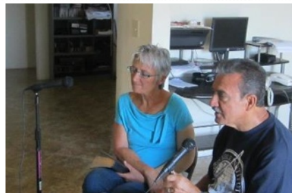
Sharing on radio station