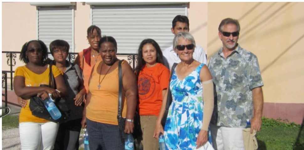
Preparing to go to a church service with some of the CBC students