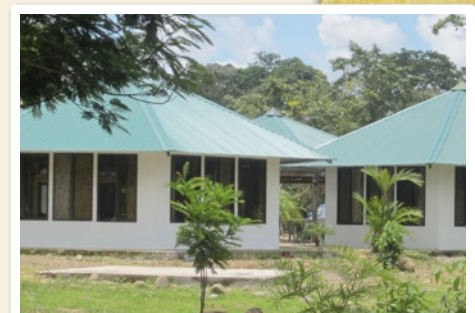
"The Garden of Hope" Retreat Center