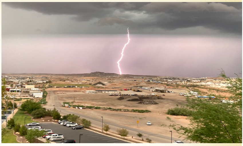
(Photo I took i in St. George, Utah that caused me to focus on the power of God)

Have you ever had an eye exam? The optician, as he is performing his exam says, "Keep your eyes on the light in front of you." Then he begins, with his array of different instruments that are equipped with their own lights, to shine them into your eye from different angles. All the while you are supposed to keep your eye open and looking only at the light in the center. This was the illustration that the Holy Spirit gave me during my quiet time as I found myself focusing on all of